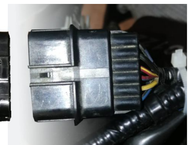
Male connector to ignition coils