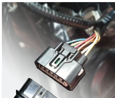
Pic.2 - female connector to main wiring harness