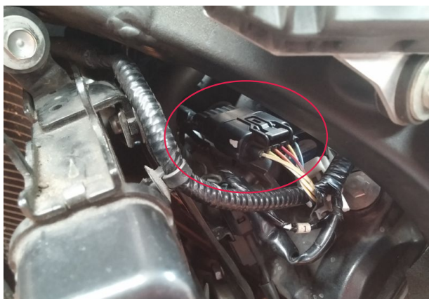
Pic.1 - location of 6way connector from Ignition coils

Connect QS sensor to QS wiring harness - black 2 pin connector.